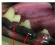
The gums are swollen and the crown to the right is worn down but not much else can be seen. You may not see any significant swelling or redness of the gums.