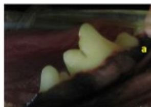
Do you see where 'a' is? It looks totally normal but it is not normal under the gum line. There is serious bone loss in this location.