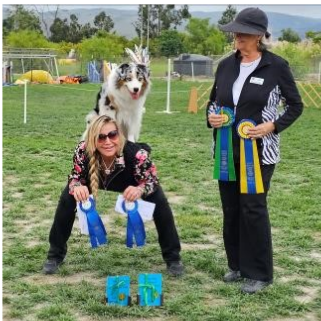
Obedience HIT and HC