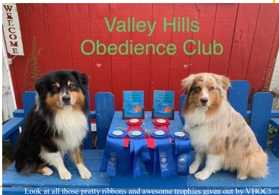
Look at all those pretty ribbons and awesome trophies given out by VHOC!

Agility - At the 10/30 ASCA trial, Rose earned 3Qs in Novice classes and her Novice Regulars title .