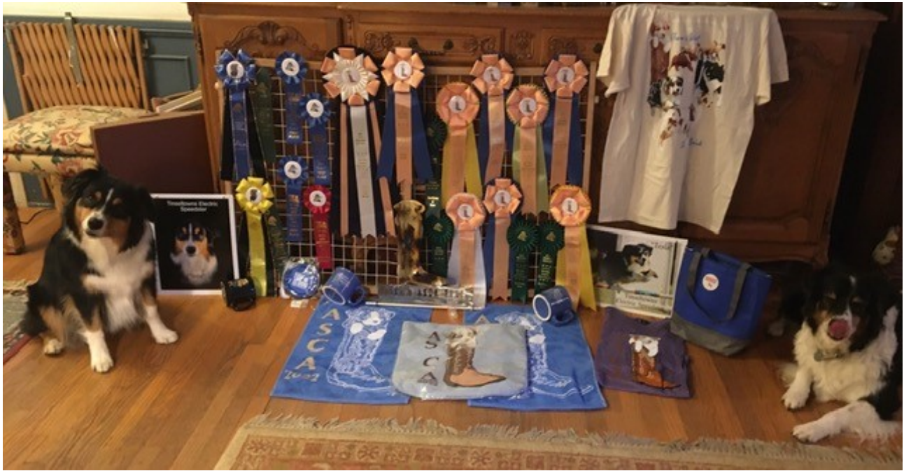
Scusi and Tesla with all their awards from the 2022 ASCA National—Bryon Texas

2022 ASCA Nationals Bryan, Texas October 31 to November 4 Agility, Obedience and Rally