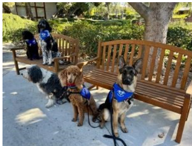
Brontay with members of the MPTF therapy dog team: From Left-Right, seated -- River and Lulu; on the ground — Sapphire, Rosie and Brontay.

For those curious about the LOAL Certification Process: The therapy dog certification process for LOAL includes a Control (obedience, temperament and behavior) Evaluation. Once the handler/dog team passes that they're allowed to begin part two in which the team must complete ten “supervised visits.” At the end of the tenth visit, the team’s evaluator conducts the Visit Evaluation. Passing this second evaluation allows the team to then apply for full, lifetime membership with LOAL. Interested in learning more about therapy dog work and the certification process? Contact VHOC members, Kathy Spilos and/or Monica Nolan.