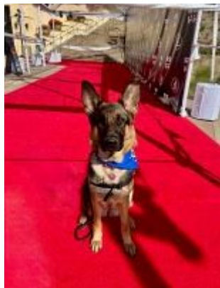
Brontay on the red carpet while visiting at Pepperdine University after the fires: