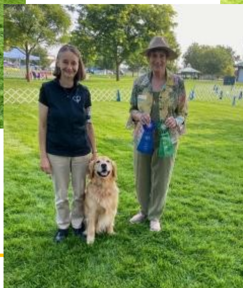
UD Leg #2