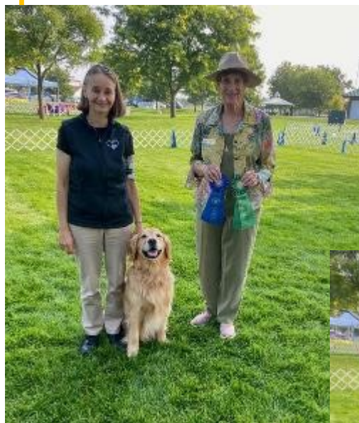
UD Leg #1

Now we're working on improving our scores (our heeling needs some polishing!) as we continue to have fun in the obedience ring!