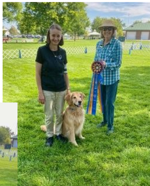
UD Title and High In Trial