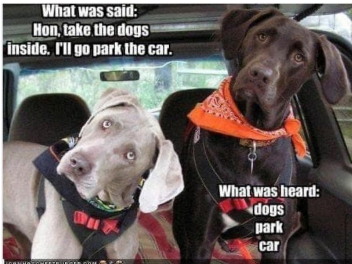
Dogs in Car—Submitted by Carole Raschella

URL—https://www.petmd.com/dog/conditions/infectious-parasitic/c_multi_leptospirosis