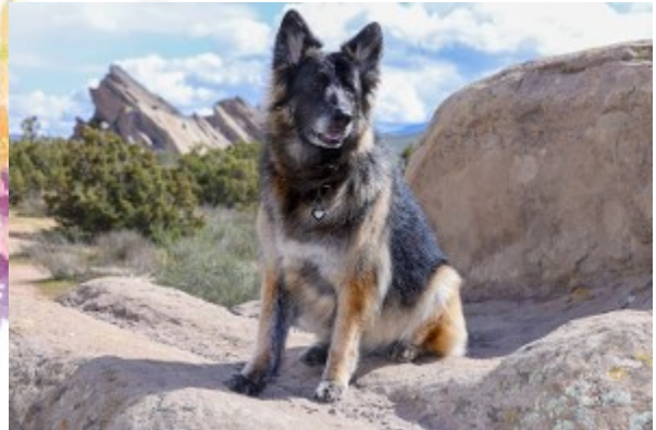
February 22, 2023

A year ago, we knew yet prayed this day would never come. A year ago, we decided no chemotherapy, and she went on “canine” hospice. A year ago, I couldn’t imagine life without her. Today, I still cannot envision this, my reality. Monday night, I asked my girl to come with me one last time, and on her terms, we walked our last steps together. I held her so tightly hopelessly knowing yet still wishing I could change our fate. She kissed me. I buried my face in her fur and gave her thousands more. She shuddered, twitched, then she slept. From my arms and with my love her only companion, she began her journey to Rainbow Bridge.