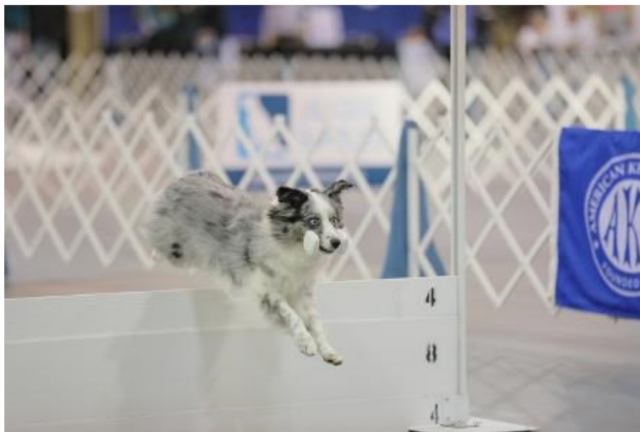
Pix 'n Pages