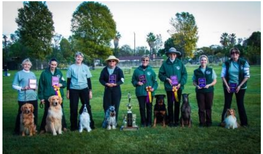
2012 1st place—Team picture

2024 1st place in Obedience Team, 1st place in Rally Team