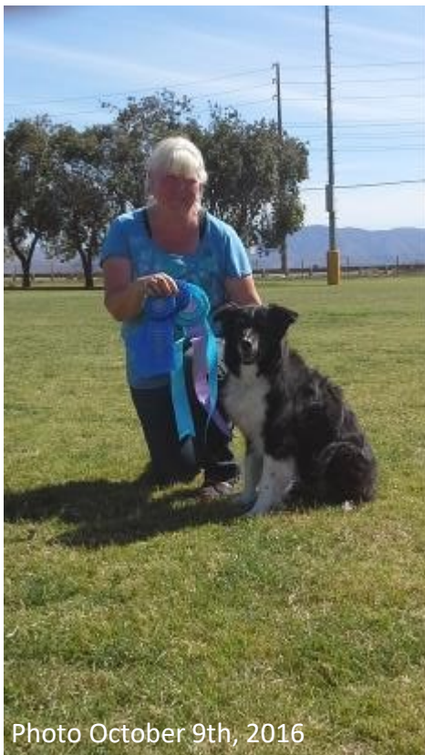
Photo October 9th, 2016