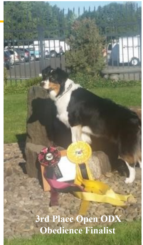
3rd Place Open ODX Obedience Finalist

Although grueling being entered in 15 classes in rings or arenas in 4 days, we managed to qualify in 9 events, with just a few simple mistakes on the others. The sheep were way too flighty for us, as with many others and the ducks I made a dumb error causing us to NQ by just a few points, thus not qualifying for the MVA award. I was very disappointed but thrilled that I have a dog who can even try. 6:30 Thursday morning walked the first agility course, then went and walked rally excellent course, then ran rally, then ran sheep run, immediately going into the open obedience run, then back to agility to run the first course, then awards for rally and obedience, then later in the day walked and ran the second agility course. Oh my that was CRAZY.