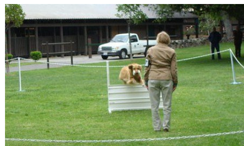
Jill earns CDX Title in 3 straight shows!