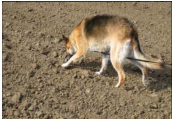
A close up: The dogs are judged for how 'deep' their noses are in the track and how intently they follow it. This is a good picture of what you want.