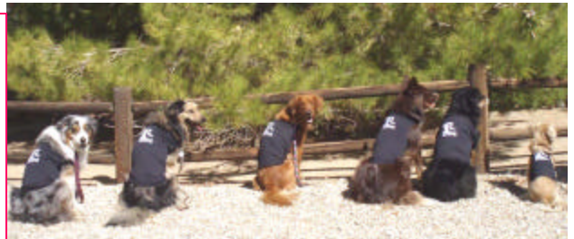
Taxi, Tasha, Quiz, Trooper, Scout, Tucker

The "Pink Ladies" (Left) and the "T-Birds" (Right) from the musical GREASE competed at the NADAC Manzanita Agility Club's Trial in Pearblossom, CA on Oct. 20-21, 2007.