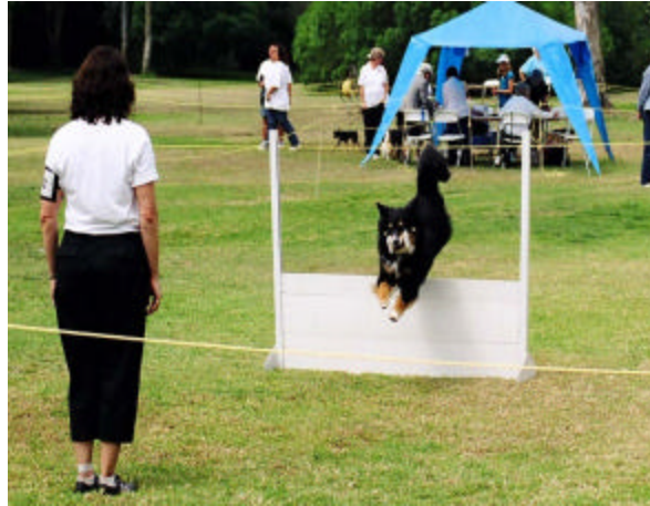
Tonka—soaring to a 198.5 and Top Open Dog