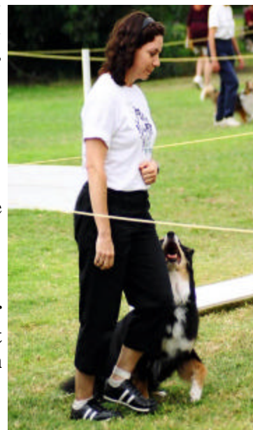
Tonka struts his stuff!