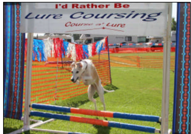
Stephanie's ZOIE goes up, up and away!