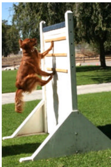
Quiz scales the 6-foot jump

her. Adding to the challenge, she kicked her legs out in front of her with each step as though she was some kind of soldier! Once we heeled with the steward to a certain point, we were told to heel at a fast pace for a distance of about 70 yards--out around a designated tree and back!