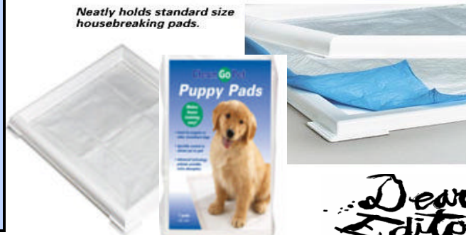
Neatly holds standard size housebreaking pads.

The University Club California State University, Northridge 18111 Nordhoff Street Northridge, CA 91330