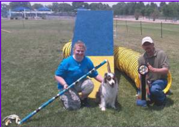
ATCH 2 Red Forrest 1040 Taxi Cab CGC

Elite Regular, 10-Q, 1st Place, Elite Regular, 10-Q, 1st Place, Elite Gamblers, 10-Q, 1st Place— ATCH2!!